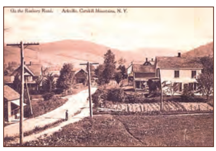
The Arkville Cut-off Road (aka County Road 38, and at the time of this photo, the Roxbury Road), was a sleepy thoroughfare in 1911.